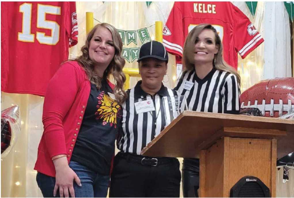
Leavenworth-Lansing Area of Chamber of Commerce Annual Banquet